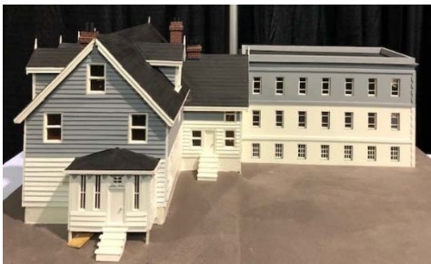
The Shannon Munn Memorial for Boys