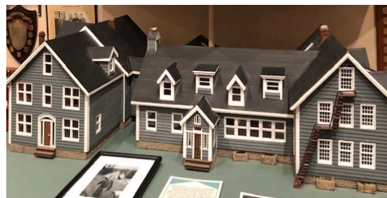
The T.R. Job Memorial for Girls